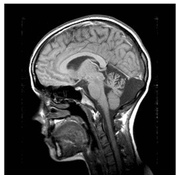
Figure 2 Sagittal T1 sequence images revealed significant cerebellar atrophy, especially in cerebral vermis in the oldest son.

an autosomal recessive mode of inheritance, found in our family, the recommend a third-step diagnostic approach. The first step is mutation analysis of the FRDA gene and biochemical testing, the second step is mutation analysis of SACS gene, POLG , APTX and SPG7 and the third step is skin or muscle biopsy. In our family, we did mutation analysis for only two most frequent gene known to cause